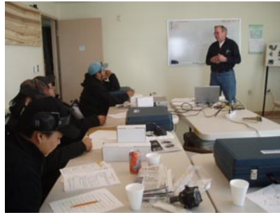
Blue plastic cases are Bacharach flu gas analyzer kits – taken back to villages by maintenance staff