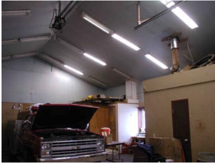
T8 lamps installed in Public Safety Building.