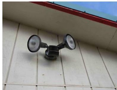
Faulty motion sensor replaced on security light.