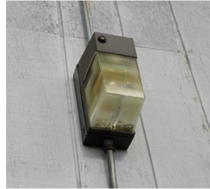
Malfunctioning photo sensor replaced on outside security light.