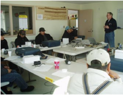
16 hours of classroom time at the Learning Center Shop