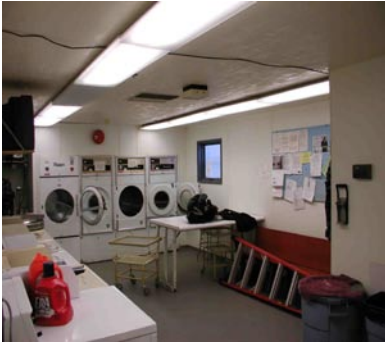
Washeteria lobby with T8 upgrades.