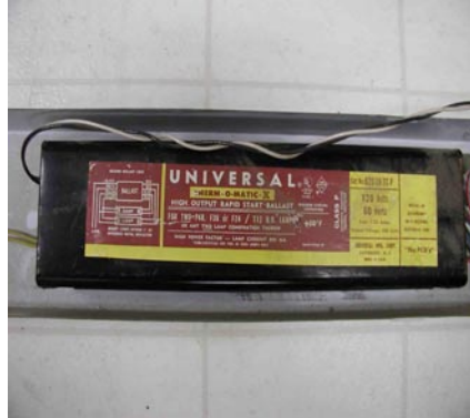
Old magnetic ballast.