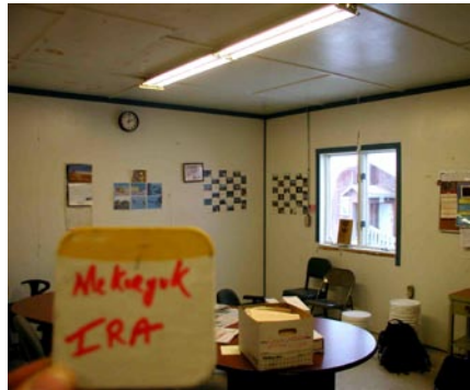
T8 lamps installed in IRA boardroom