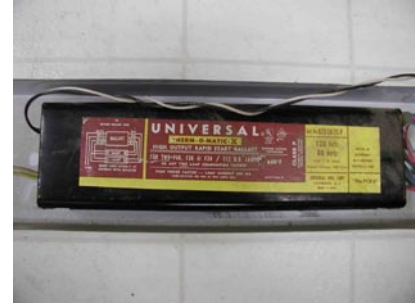
Old High Output fixture taken off line.