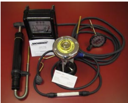
Components of a Bacharach Flu Gas Analyzing Kit used in boiler efficiency training and left with capable maint staff in their villages.