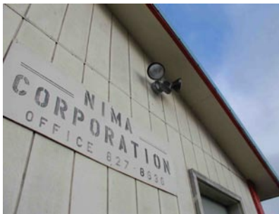
NIMA Corporation office building.