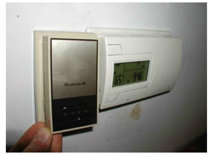
Programmable thermostat replaces old thermostat.