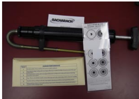
Smoke-test kit for analyzing flu gases for boiler efficiency