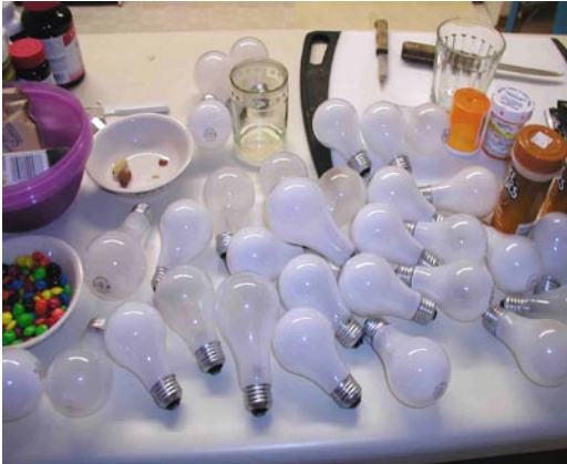
Used incandescent bulbs replaced with CFLs in one LKSD teacher housing unit.