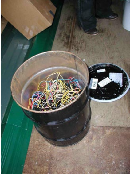
PCB Ballast drum.

All waste lamps and ballasts were removed from the community for recycling including forty-four PCB ballasts.