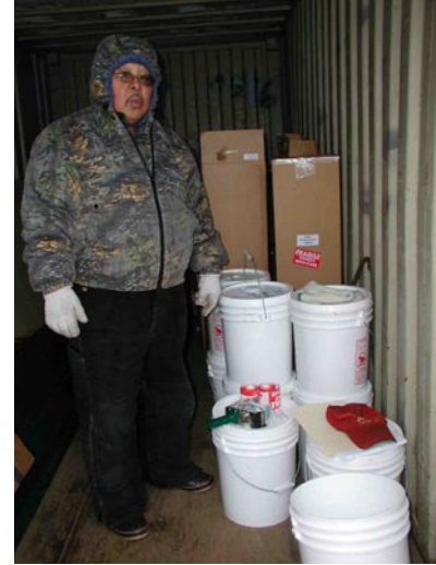
Waste lamps and ballasts prepared for shipping