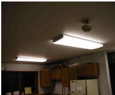
T8 lamps installed in Old City Office/Clinic.